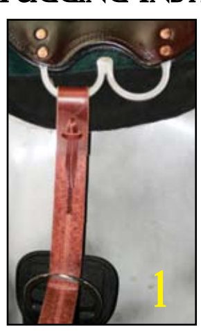
Step 1: Bring the tie strap attached to front dee down to girth and loop through girth from inside out