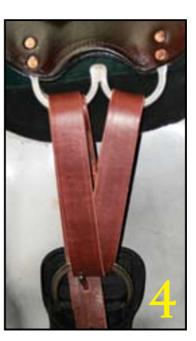
Step 4: Put tie strap back through the front dee and down through back of girth ring; use girth buckle to fasten tie strap. Bring any excess tie strap to the tie catcher. Done!