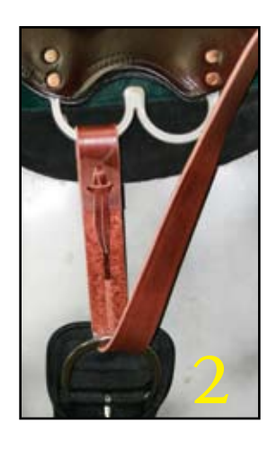
Step 2: Bring the tie strap from girth to the top of the second dee and loop through